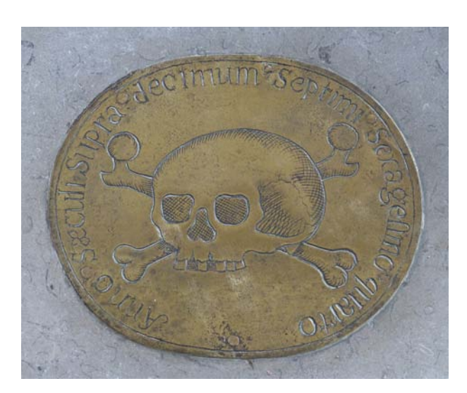
Detail from the Littleton brass

prayer, dressed as an ordinary gentleman. That would have been the same if he had already been called as a barrister. Only judges and the special order of serjeants-at-law, from which judges were drawn, wore special robes.