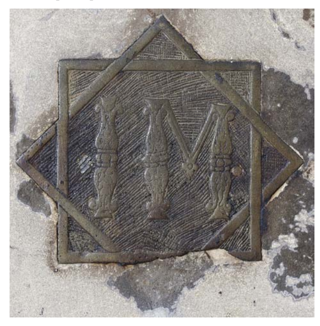
Rebus from the Marsh brass, 1561 (M.S.IV)