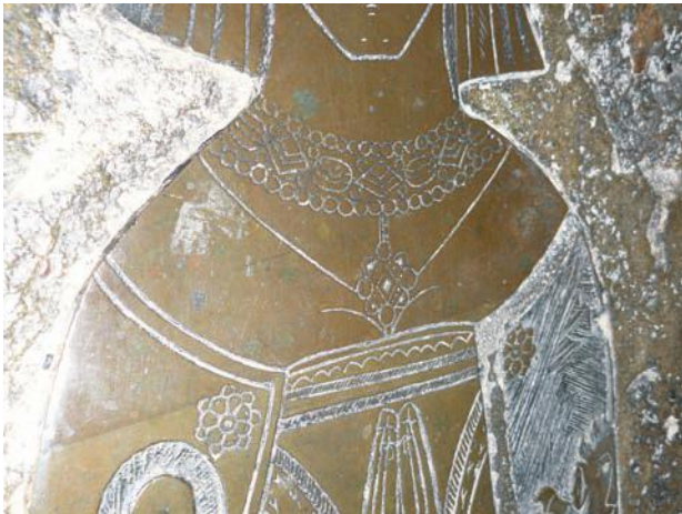
Detail of jewellery on the Tiptoft brass