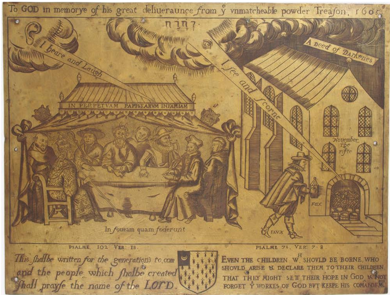
The Strode Brass at Elton House, Bath