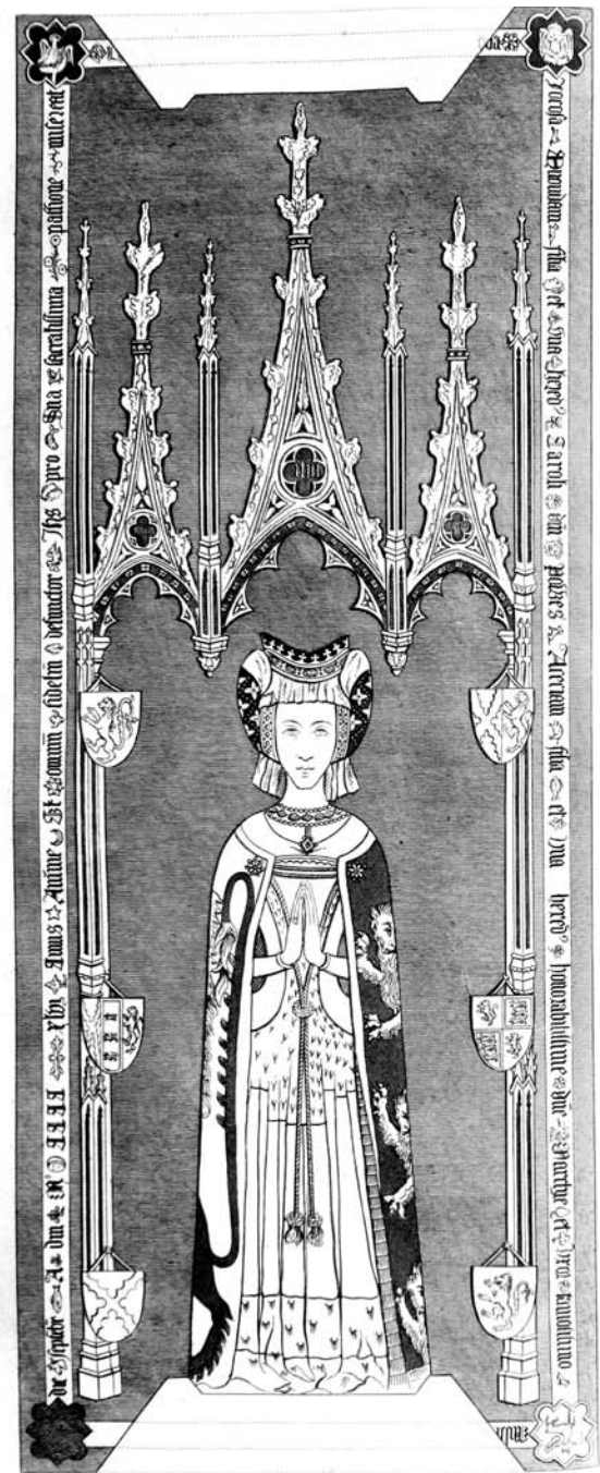
M.S.I. Lady Joyce Tiptoft, 1446, at Enfield Engraving from Richard Gough's Sepulchral Monuments