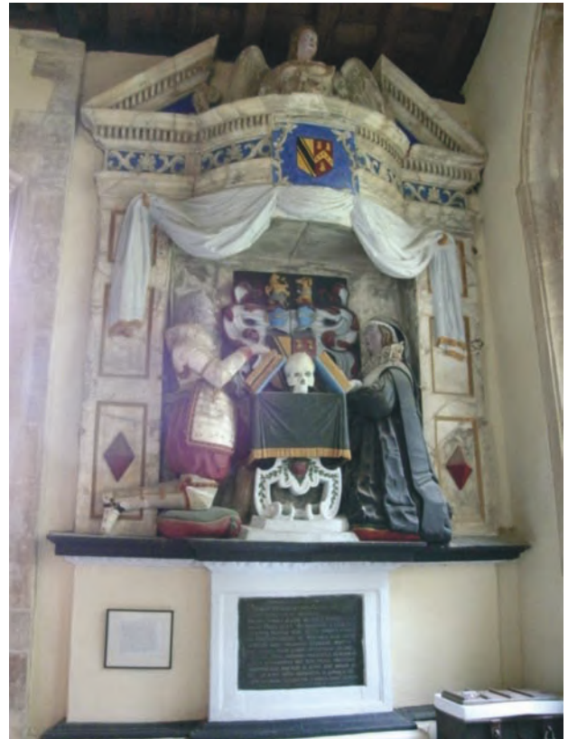
The Hanbury Monument at Kelmarsh

still shows evidence of the score marks used so the letters could be cut and set on level lines. These and other scratches mar the surface of the plate. Above the brass inscription are the two effigies of Sir John Hanbury and his wife, facing each other over a prayer desk. A painted coat of arms is behind them and they kneel under a draped sheet resembling a canopy. Above this, is another decorated frieze which in turn is topped by a broken pediment with a figure of a winged angel in