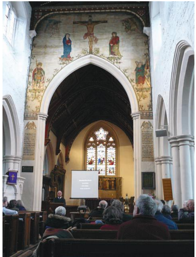
Society members in Enfield church