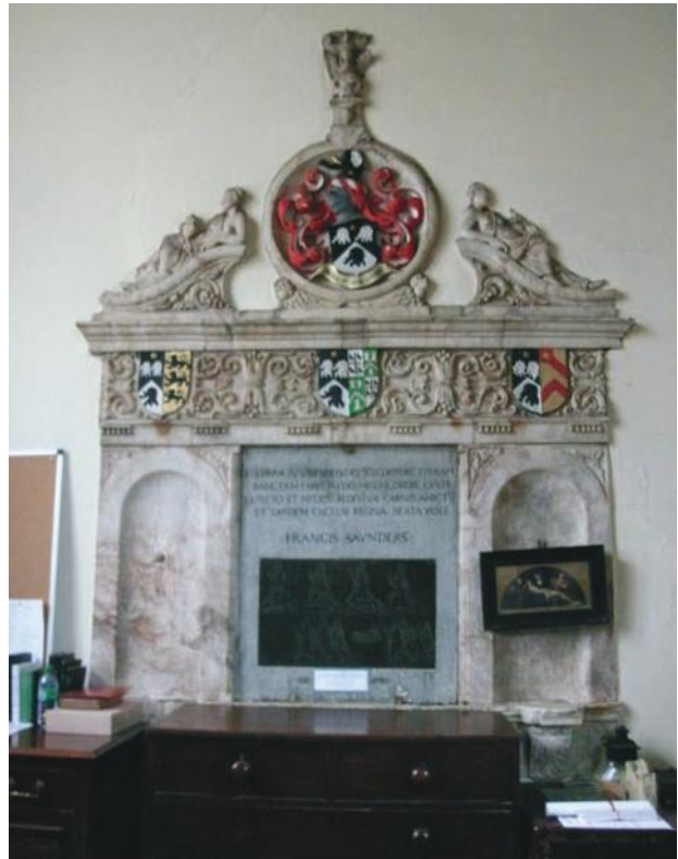
The Saunders Monument at Welford